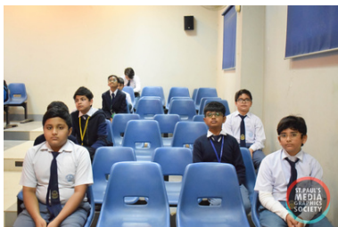
(Math bee held by our mathematic society)