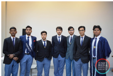
(Members of the Mathimatiká Society)

In the future, the Descartes Mathimatiká Society plans to host more events to inspire students' love for math. These events will include competitions, talks, workshops, and question-and-answer sessions. By making math enjoyable and encouraging friendly competition, we hope to motivate more students to excel in STEM (science, technology, engineering, and mathematics) fields. We sincerely thank our founding team, patrons, and participants, and we also like to thank the volunteers for their dedication that made the Math Bee and the dreams of the Descartes Mathimatiká Society a reality. We appreciate your ongoing support as we advance mathematics education and talent development.